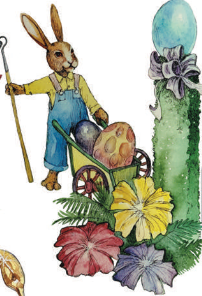
Easter Egg Topiary Pedestal 339704/06 4' Tall $1050 6' Tall $1350