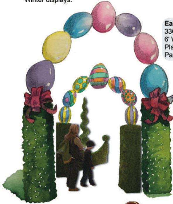
Easter Egg Archway 330501 6' Wide x 8' tall Plain $3570 Pattern $4200

More Easter Eggs! We have so many fun ideas and ways for you to display your Easter eggs including atop potted plants and topiary pedestals or in an Easter Egg archway . Turn your candy gum drop tree into an Easter Egg Tree for Spring time. Or check our Swan sleigh , also perfect for both Spring and Winter displays.