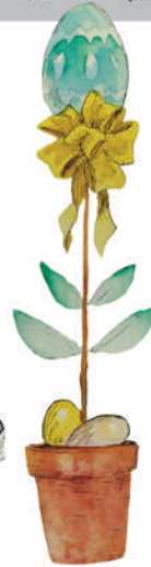
Easter Egg Potted Plant 339804/06 4' Tall $1050 6' Tall $1350