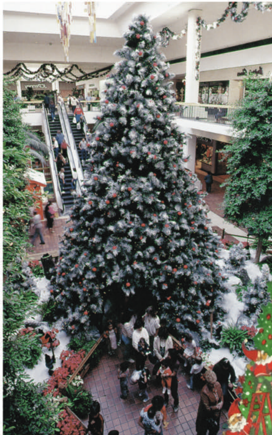
Walk-Through Flocked Long Needle Pine Tree

Customize your giant feature tree by making it a walk-through tree with a tunnel or a space inside to see Santa Claus. Or simply fill a giant Christmas tree with silk poinsettias - we can wind the silk flowers right into our branch system eliminating any watering needs! Also check out our different style Christmas Tree Toppers , from Classic Stars to Lighted Star Bursts.