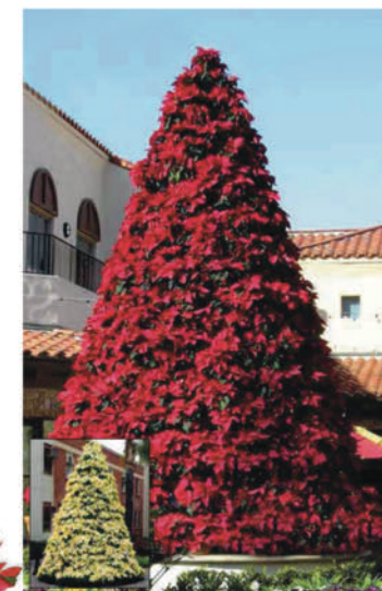
Poinsettia Tree in Red or White Poinsettias